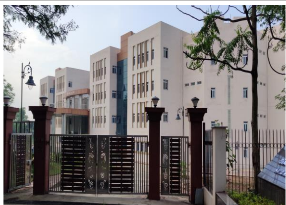
Diamond Jubilee Lecture Hall Complex National Institute of Technology Jamshedpur

National Institute of Technology Jamshedpur is an Institution of National Importance, by an Act of Parliament (Act 29 of 2007) namely, the National Institutes of Technology Act, 2007, which received the assent of the President of India on the 5th June, 2007. This was formerly known as Regional Institute of Technology (RIT) Jamshedpur and was established on 15th August 1960 with the aim of nurturing young engineers for economic growth of the Nation. NIT Jamshedpur is situated in the western part of the city Jamshedpur. The flowing river Kharkai and picturesque backdrop of low hills on one side, and large tracts of forest on the other side, make the 341 acres of rolling campus an ideal place for higher learning and research. NIT Jamshedpur has well qualified faculty and dedicated supporting staff.